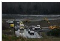
Project back to Plan A: Riverfront developer retreats from proposed changes