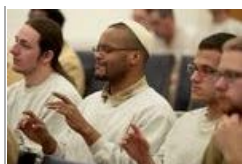
Captive but thankful fans: Symphony musicians play for Monroe inmates (video)